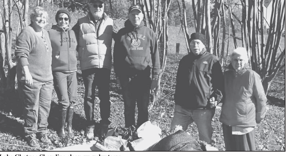
Lake Chatuge Shoreline clean-up volunteers

To register for the clean-Last year 40 volunteers up, visit https://mountaintrue. org/event/2022-lake-chatugeshoreline-cleanup/ or call 828-837-5414. T(Oct26,F1)JH