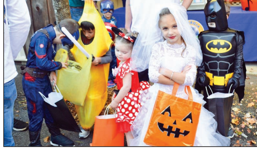
The Georgia Mountain Fairgrounds will host the Hiawassee Halloween event for the second