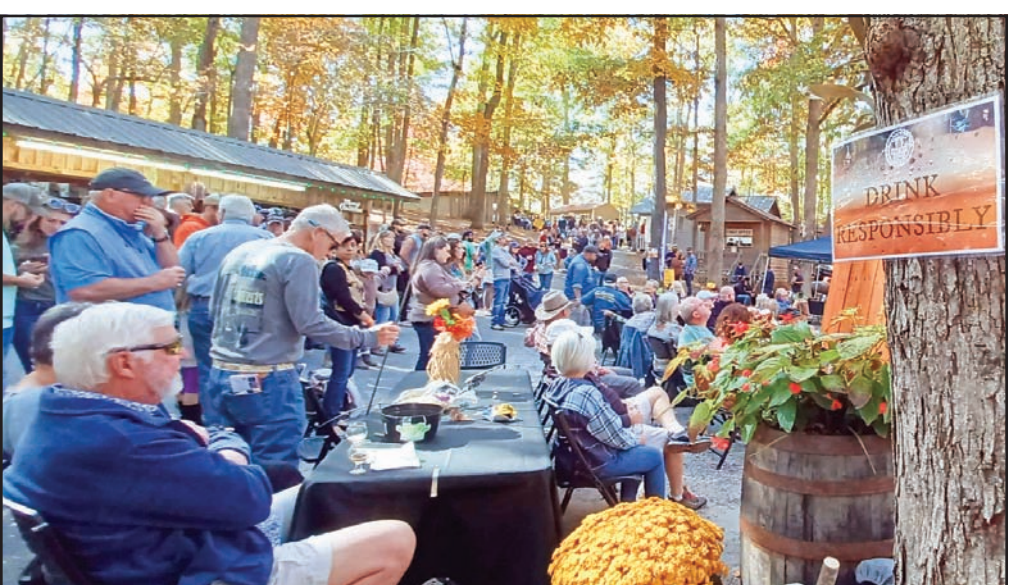
The 2022 edition of the Appalachian Brew, Que & Stew Festival set a record for attendance at the annual event on Saturday.