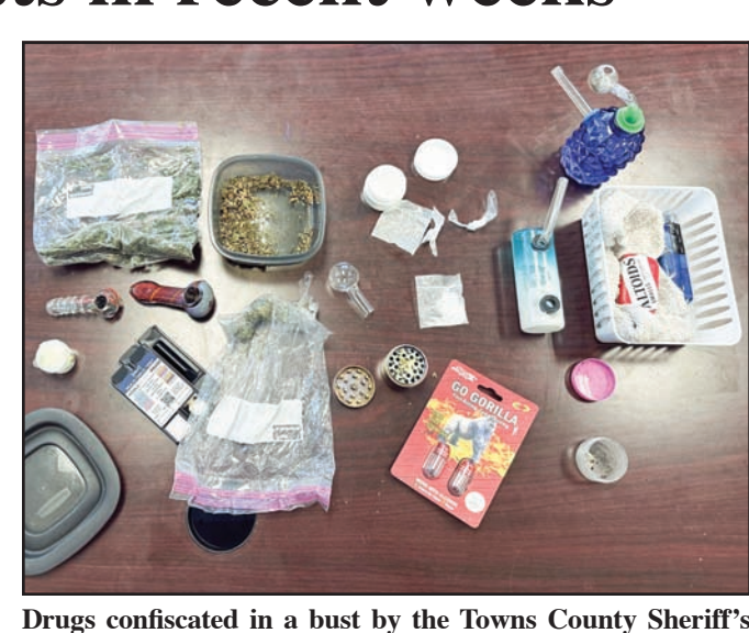
Office on Thursday, Oct. 20.

also charged with felony pos-See TCSO Drug Bust, Page 6A